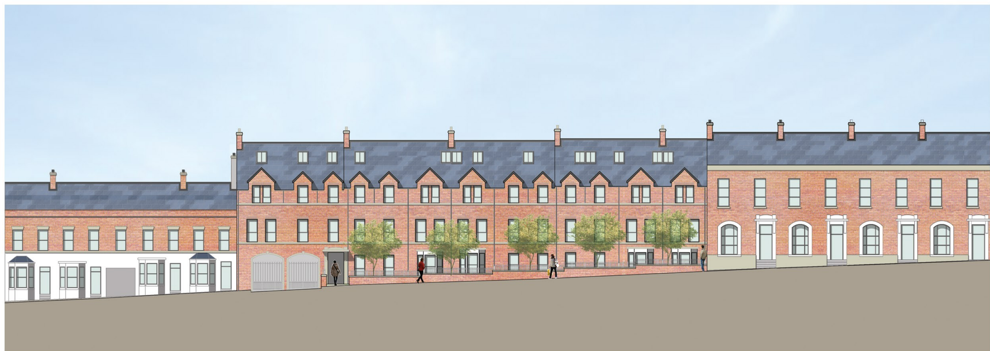
TATES AVENUE ELEVATION