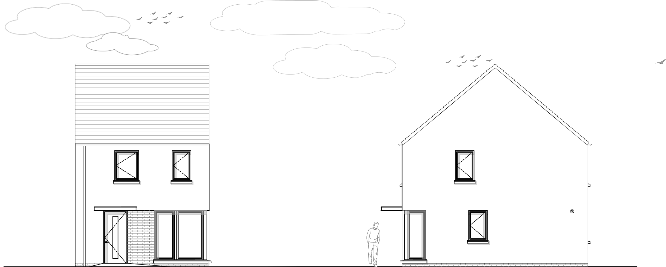
Front Elevation Scale 1:50