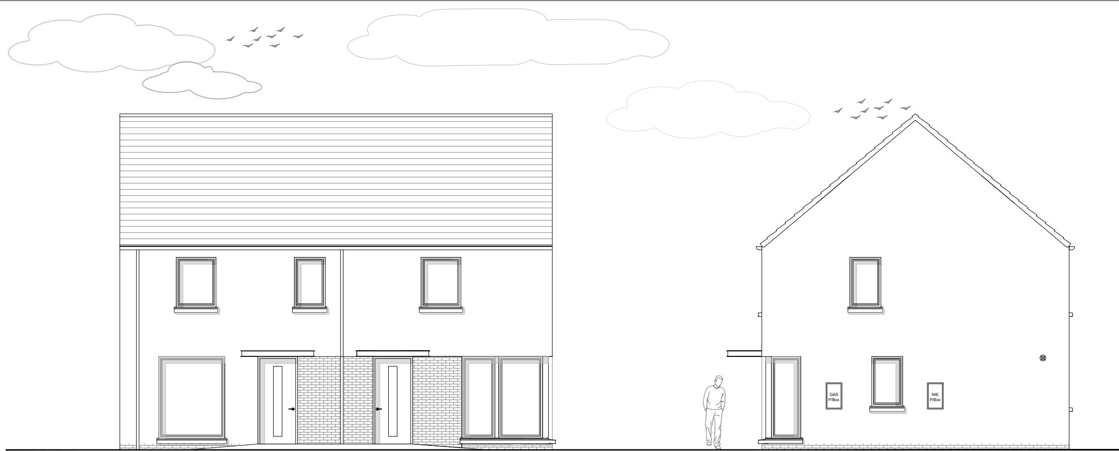
Front Elevation Scale 1:50