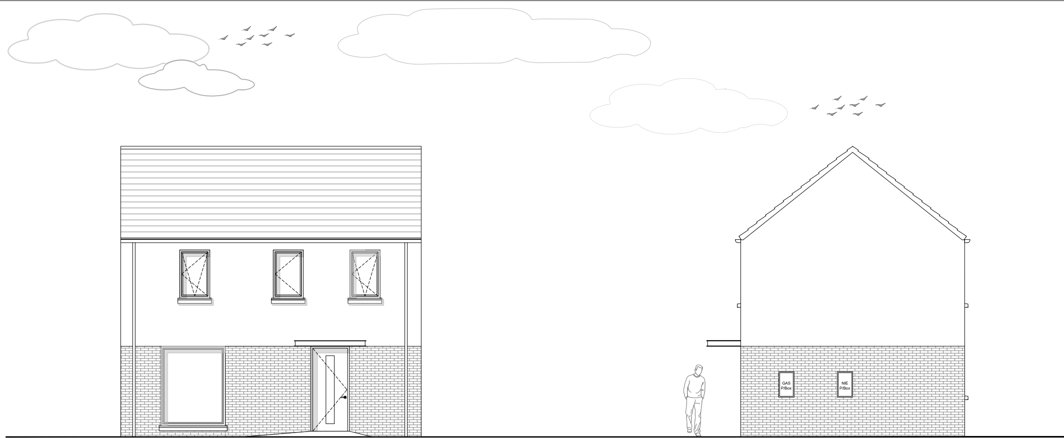
Front Elevation Scale 1:50