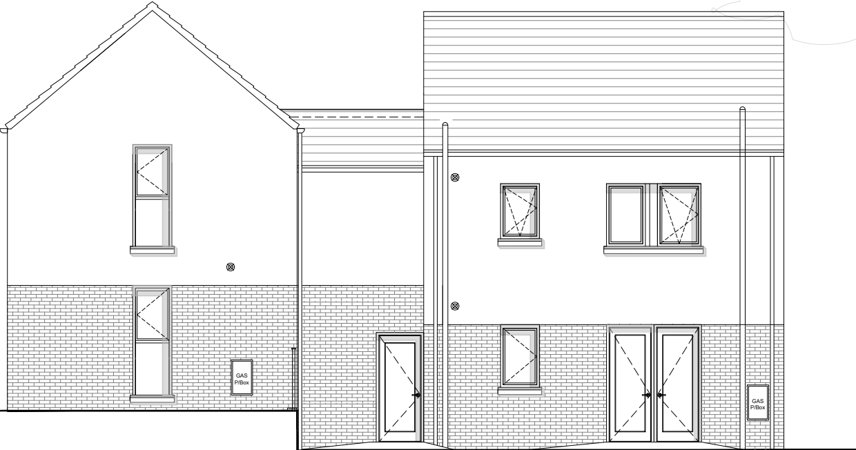
Rear Elevation Scale 1:50