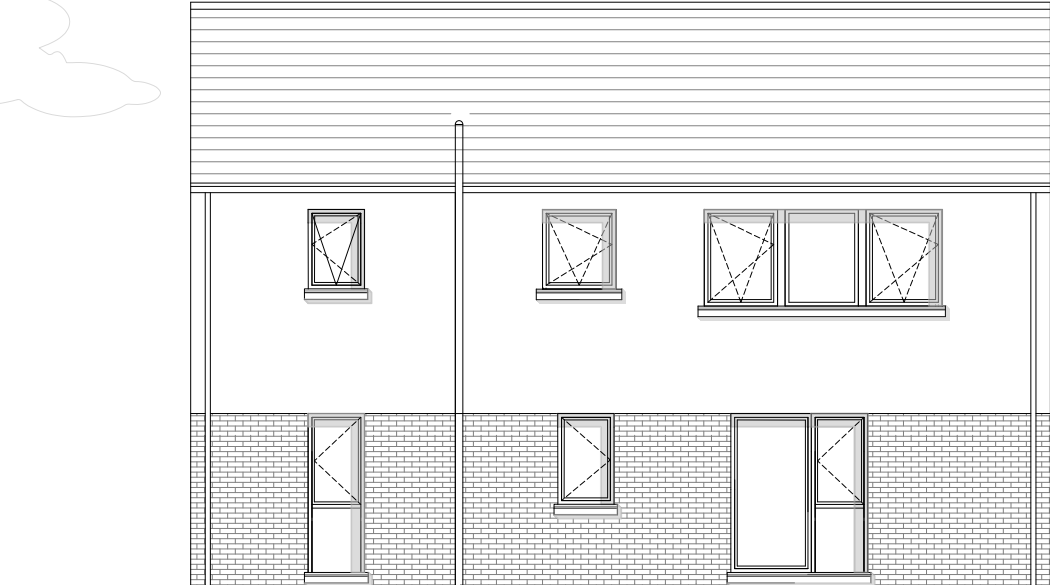
Side Elevation Scale 1:50