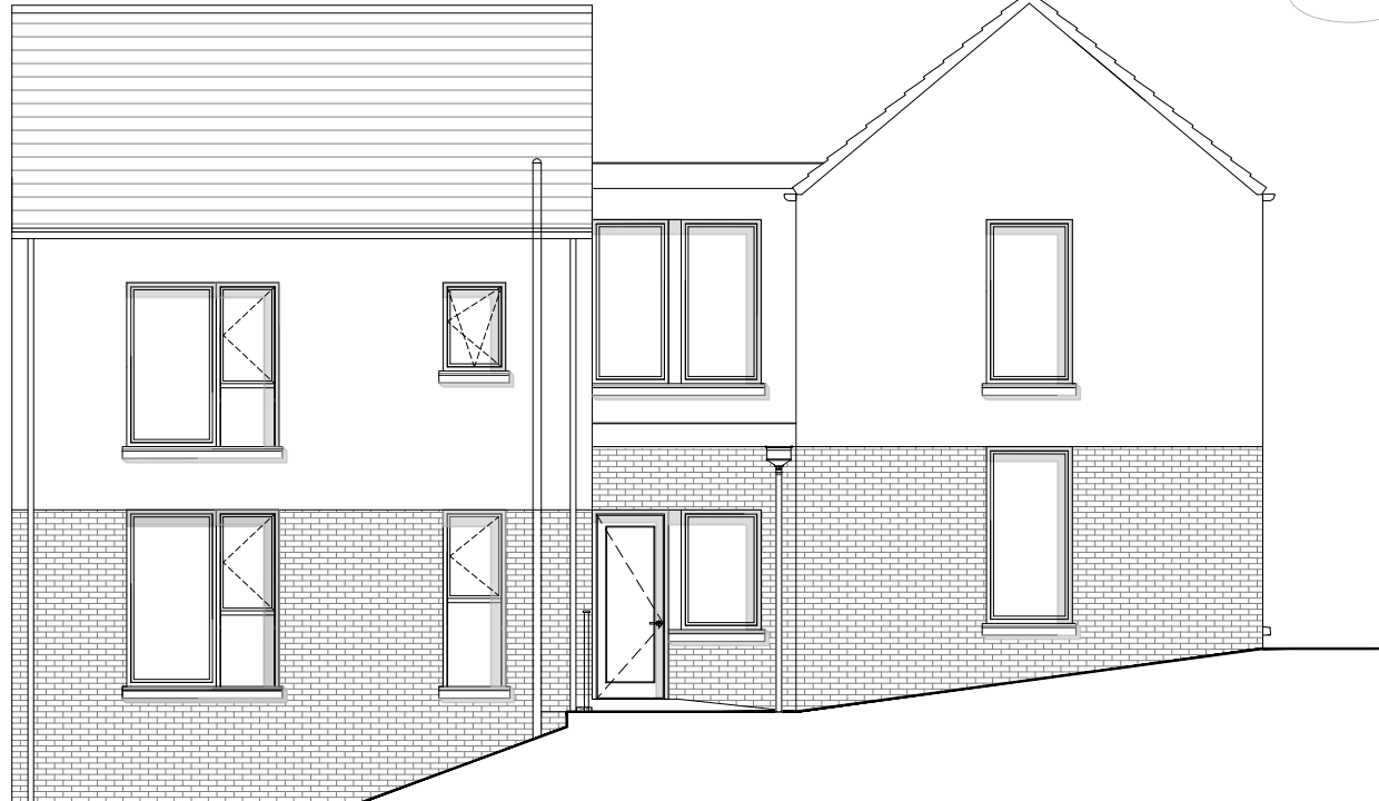
Front Elevation Scale 1:50