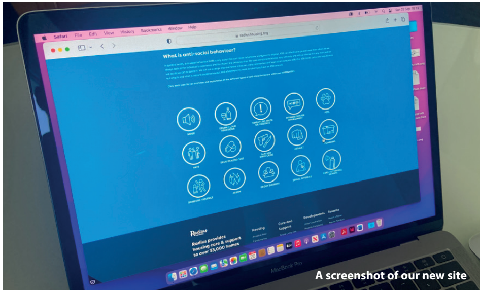
A screenshot of our new site

Radius acknowledges that everyone is entitled to live in peace within their neighbourhood and is committed to tackling anti-social behaviour in our communities.