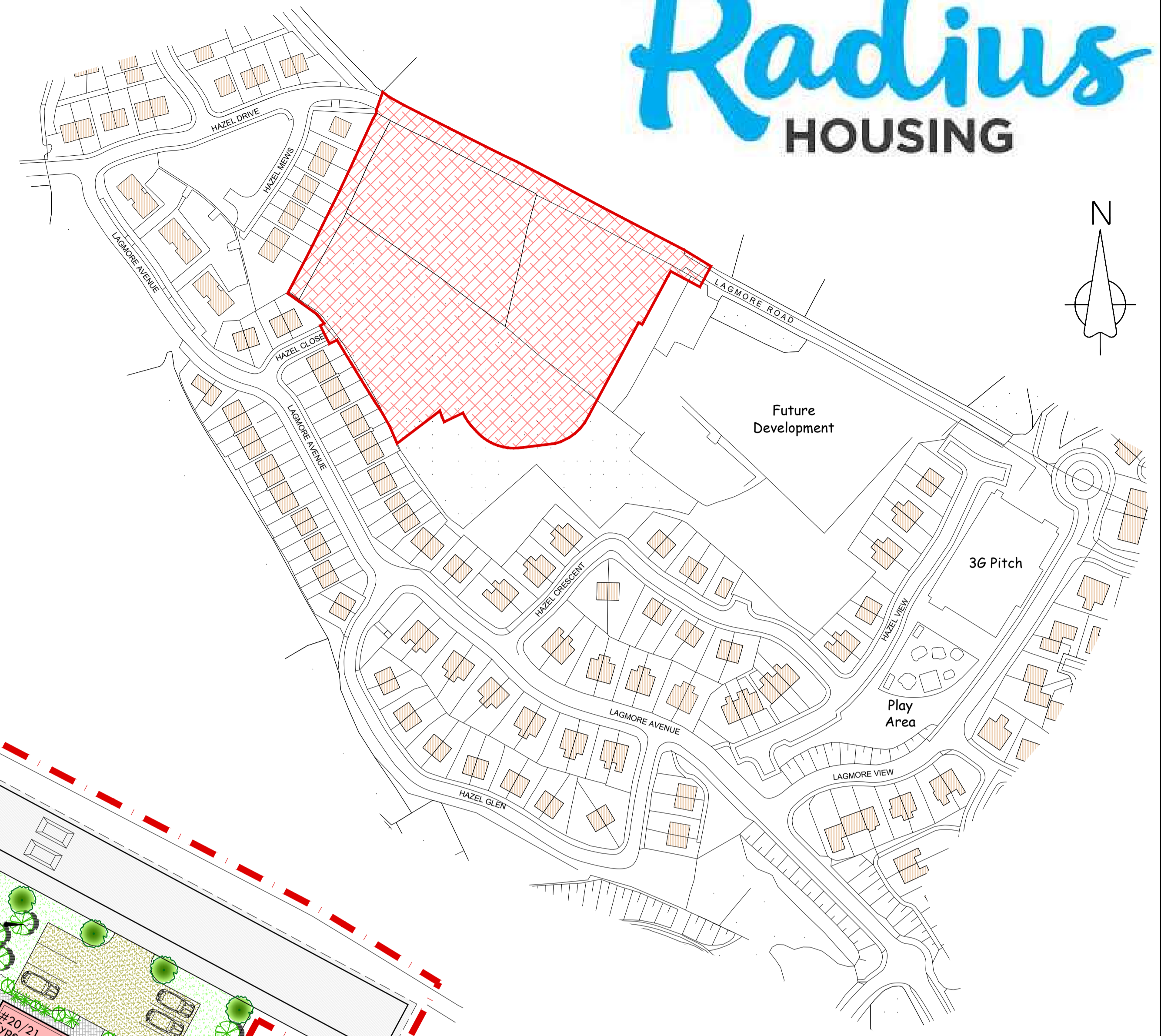
Site Context Plan