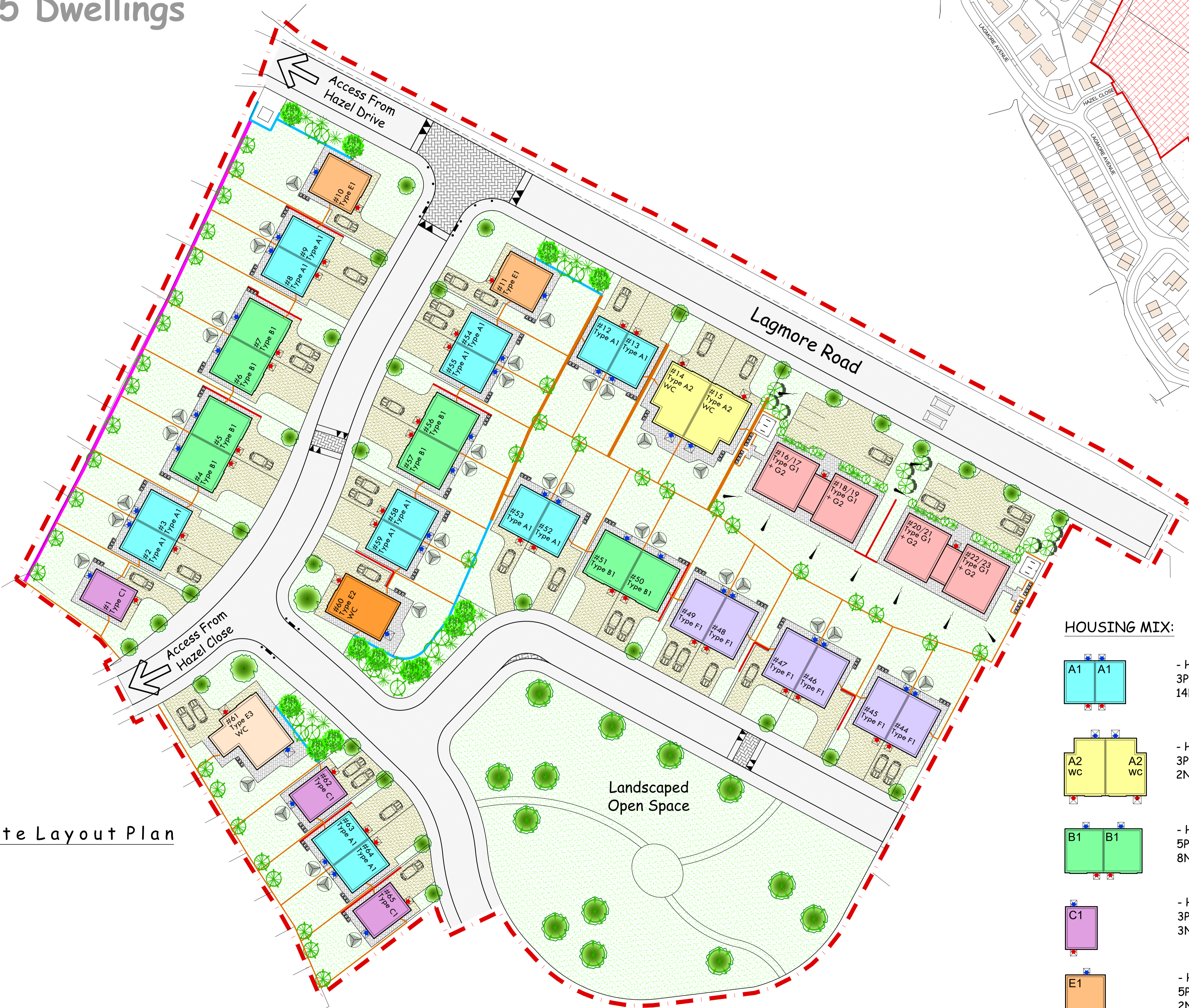
Site Layout Plan