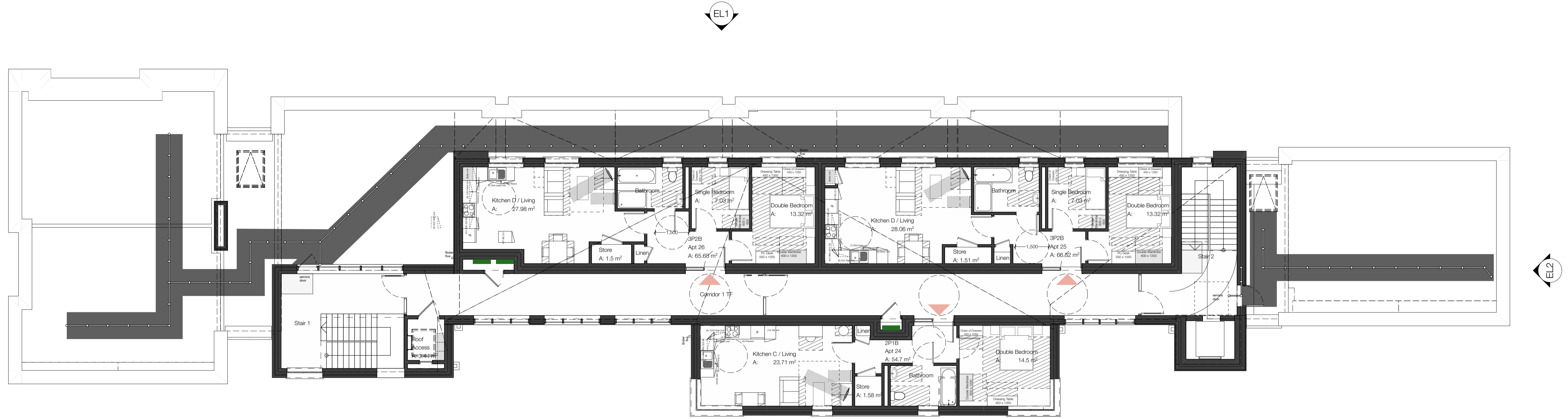
03-Third Floor 1:100