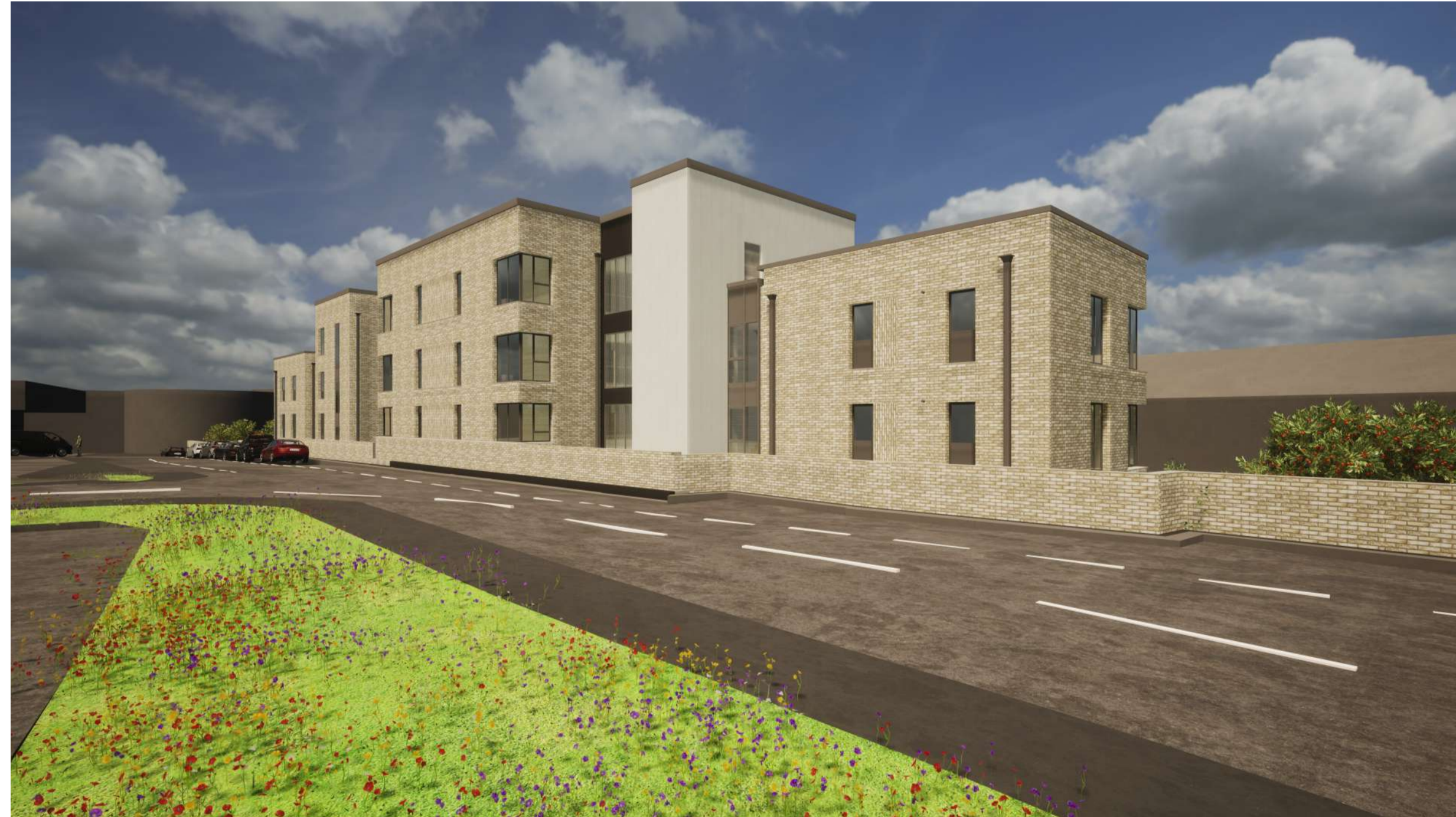
Image 3 from Mill St car parks