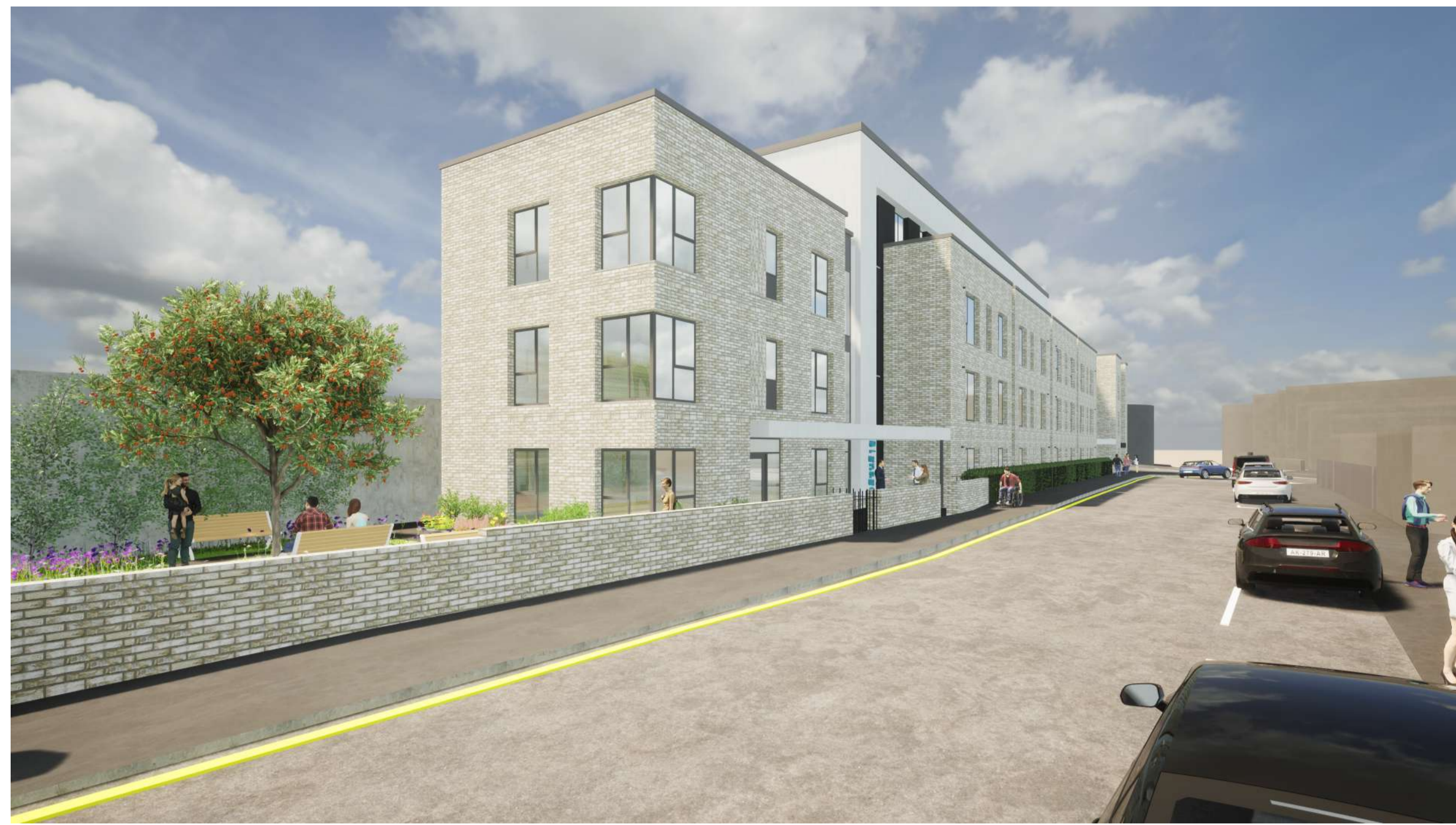
Image 1 from Circular Rd / Church Ln junction