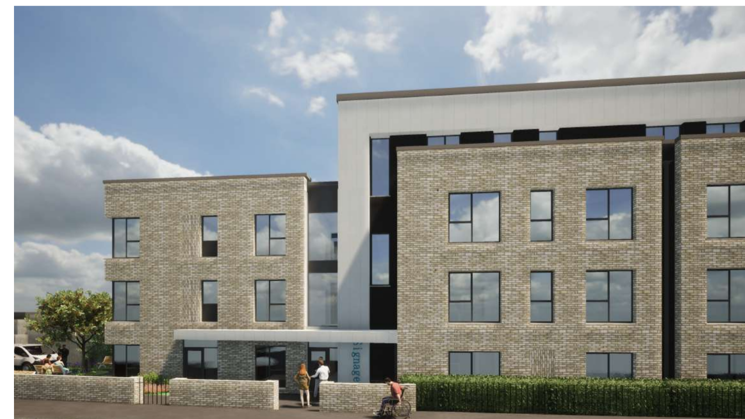
Image 5 from Circular Rd of main entrance