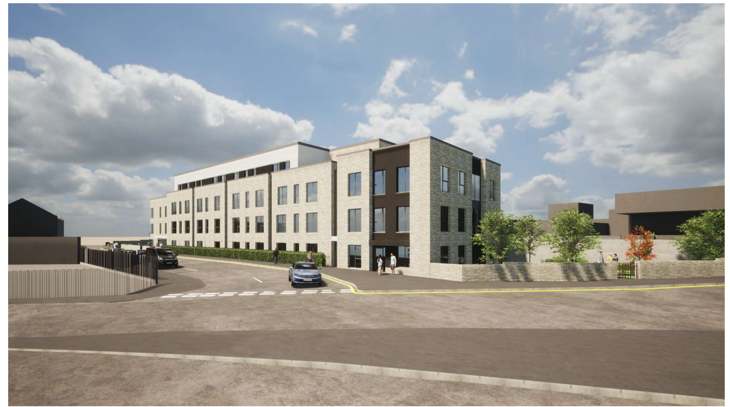
Image 2 from Millburn Rd / Circular Rd junction