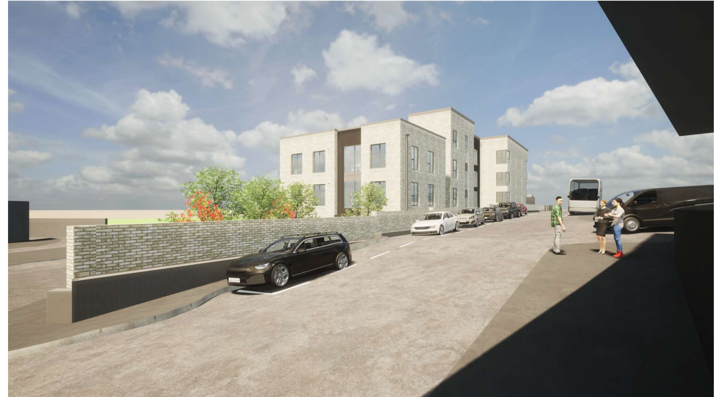
Image 4 from Abbey St / The Mall at Menarys