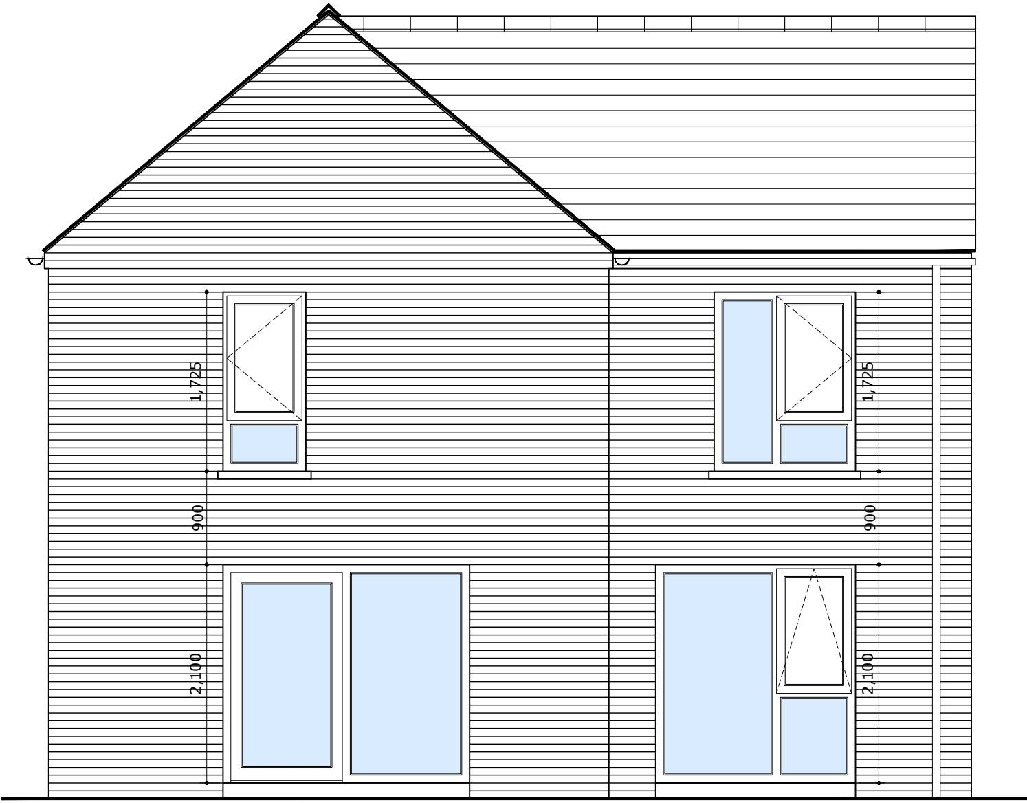
plot 1 : rear elevation